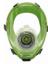
Full face masks BLS 5400 - BLS 5150