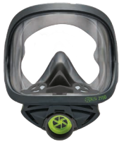
Full face masks BLS 2150 - BLS 2150V