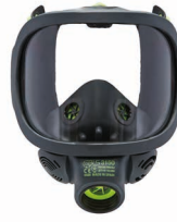
Full face masks BLS 3000