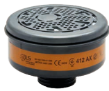
Filters BLS 400 series