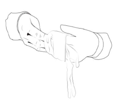
4) Insert the left, gloved hand into the cuff opening of the