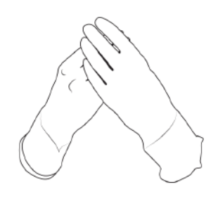
6) Pull the gloves up over the cuffs of the gown.