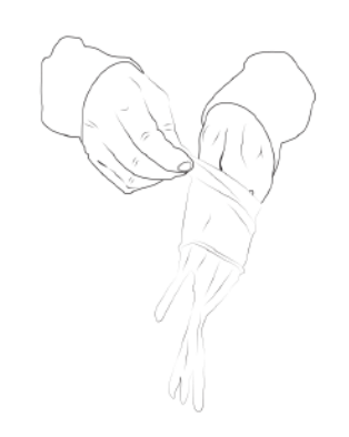
3) Holding the exposed inside cuff of the left glove with the right hand, put on the glove.